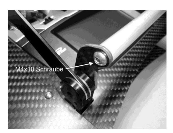
Ill. 7 screw