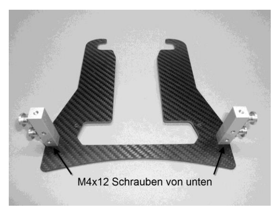
Ill. 1 M4x12 screws from below