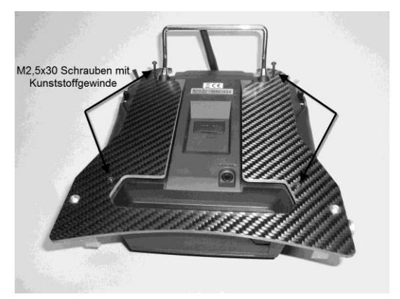
Ill. 2 M2,5x30 screws with synthetic thread