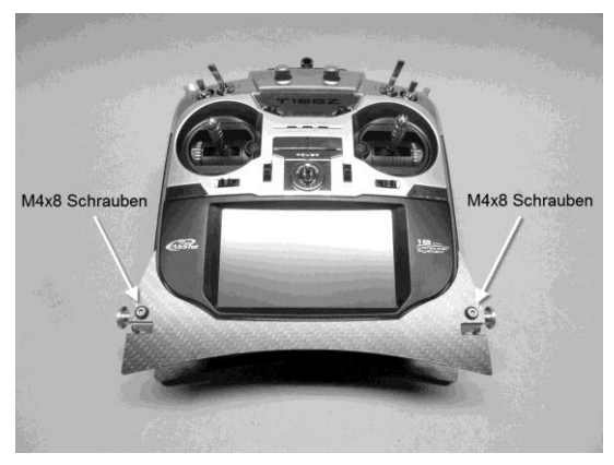
Ill. 3 screws