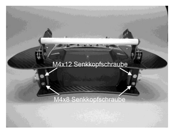
III. 8 M4x12 countersunk screw M4x8 countersunk screw