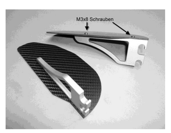
Ill. 4 screws